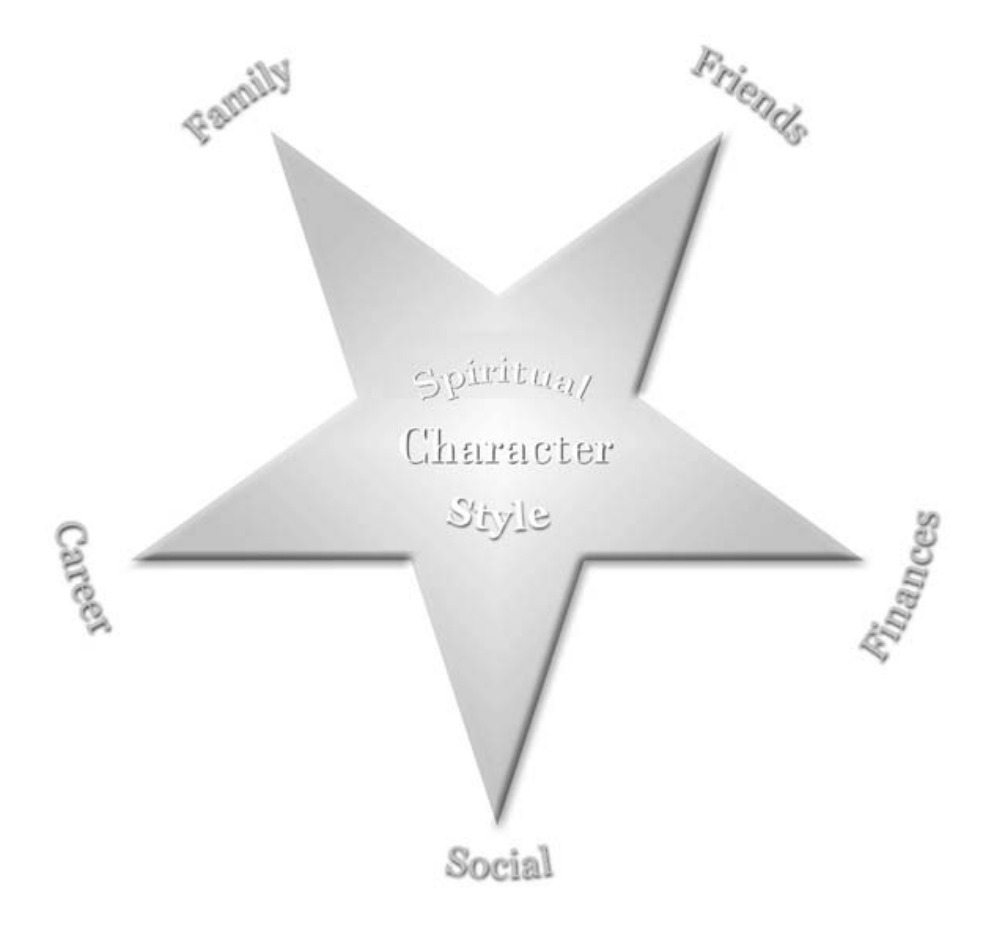
Figure 2. The Interpersonal Domains of Becoming A Brilliant Star

An important principle regarding the functioning of these domains and core elements is that the whole is more than the sum of its parts. While it is important to identify the parts, it is vital to pay attention to the functioning of the whole. Bandura (1986, 1997) describes this type of relationship as "reciprocal determination." That is, one can neither fully consider character without considering all of the domains nor fully consider cognition, affect, or conation without considering each of the others as well as the core elements. Mustakova-Possardt (2004) suggests critical moral consciousness as the phenomena of study when all of these domains and core elements are considered simultaneously.