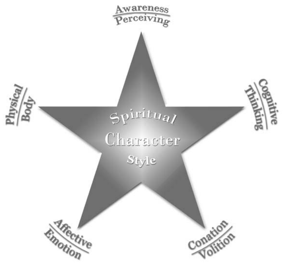
Figure 1. Interpersonal Domains and Core Elements of the Brilliant Star Model

The interpersonal domains include areas in which the individual is expected to demonstrate social competencies (see Figure 2):