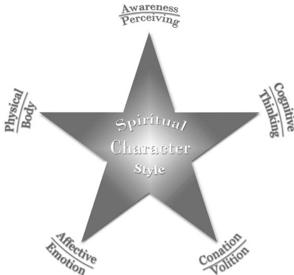
Figure 1. Interpersonal Domains and Core Elements of the Brilliant Star Framework

An important principle regarding the functioning of these domains and core elements is that the whole is more than the sum of its parts. While it is important to identify the parts, it is vital to pay attention to the functioning of the whole. Bandura (1986, 1997) describes this type of relationship as “reciprocal determination.” That is, one can neither fully consider character