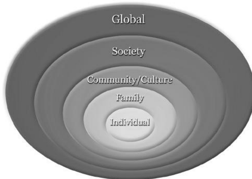
Figure 3. A holarchy of personal development

The complete framework then consists of the ten domains and three core elements as well as the developmental ecology within which the individual lives and develops. This perspective is similar to the list of developmental assets proposed by the Search Institute (Scales & Leffert, 1999). In the Search Institute approach, adolescents need to have an environment that is conducive to development (labeled external assets), and acquire a set of knowledge, attitudes, and skills required for successful passage through adolescence into adulthood (labeled internal assets). The twenty external assets are specific factors of social capital provided by the family, school, neighborhood, and community (including religious organizations and adult role models) and must be taken advantage of by the adolescent. These are arranged in four categories: